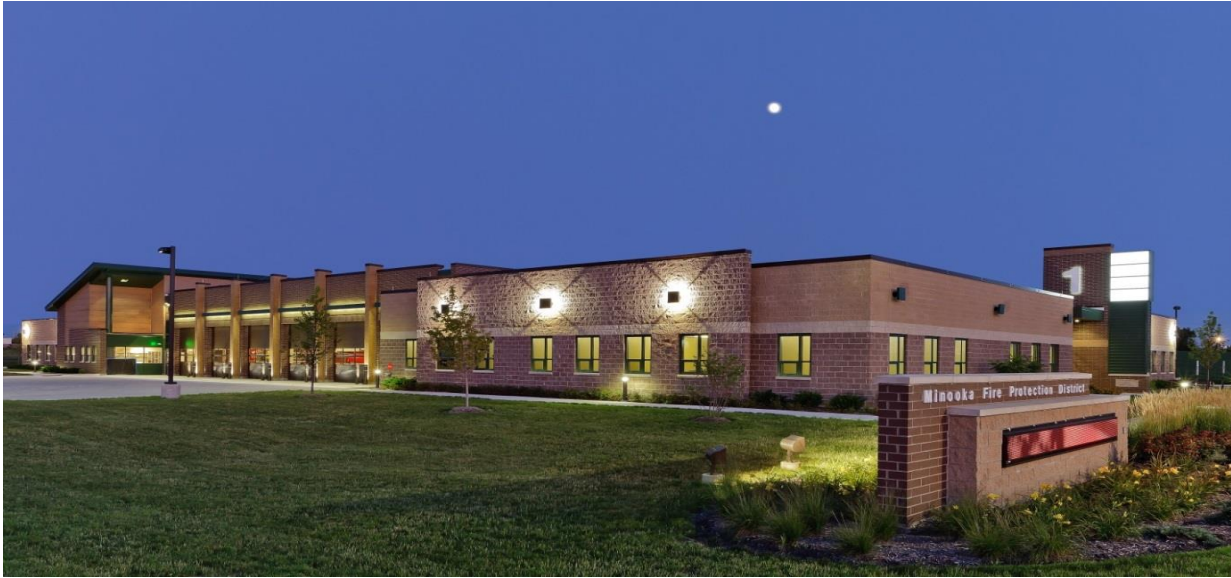
MINOOKA FIRE STATION #1- HEADQUARTERS

The administration of the Fire Protection District is operated from Fire Districts Headquarters – Station 1, located at 7901 E. Minooka Rd. The headquarters serves as the home to our administrative offices of the fire chief, deputy chief and administrative staff, fire prevention & education and training programs and EMS coordinator. The station also provides residential facilities for firefighter/paramedics working 24 hours shifts. Station #1 includes our training classrooms that can seat up to 60 people.