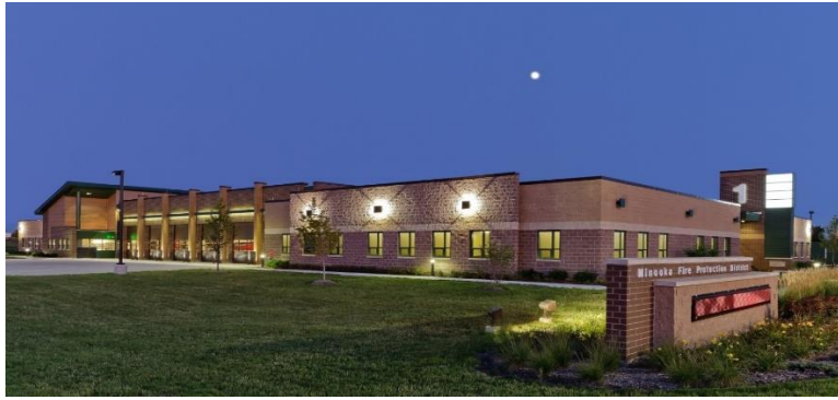
MINOOKA FIRE STATION #1- HEADQUARTERS

Station #2 is located at 28200 E. Rt. 6, Channahon, near the industrial plants on U.S. Route 6. Station #2 serves as a response facility for the southern areas of the fire district, including the U.S. Route 6 industrial corridor and is equipped with an ambulance and engine. The facilities house no administrative or support offices and serves as a response station only.